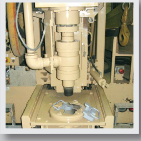
Top and Bottom Drive